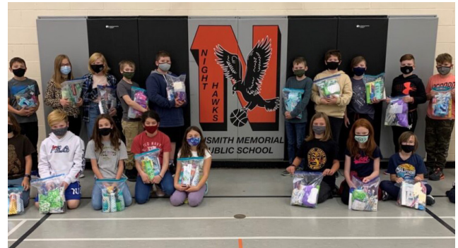
Grade 5 and 6 students at Naismith Memorial Public School in the Upper Canada District School Board decided to help, after learning about youth homelessness in Lanark County and how simple things can make a difference.