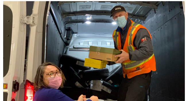
National Tire Distributors was a huge help with deliveries.