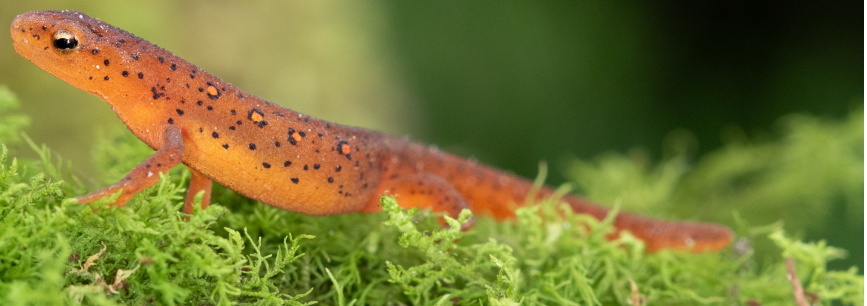
Eastern newt @ MacSkimming Centre, taken by Bill McMullen in September 2024