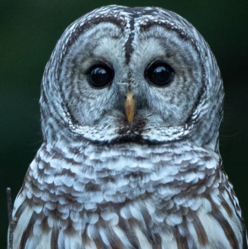
Barred owl @ MacSkimming in September 2024

OCDSB Outdoor Education Centres- Bill Mason and MacSkimming Centres Email: outdooredcentres@ocdsb.ca Website; www.ocdsboutdooreducationcentres.ca Phone # 613-833-2080 Youtube: @ OCDSBOutdoorEducationCentres Instagram @ OCDSBOutside