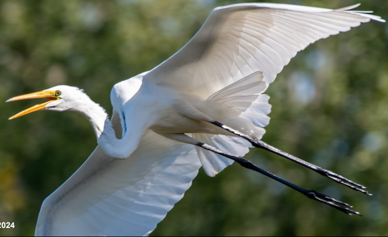
Great egret @ MacSkimming Centre taken by Gord Carter on September 2024