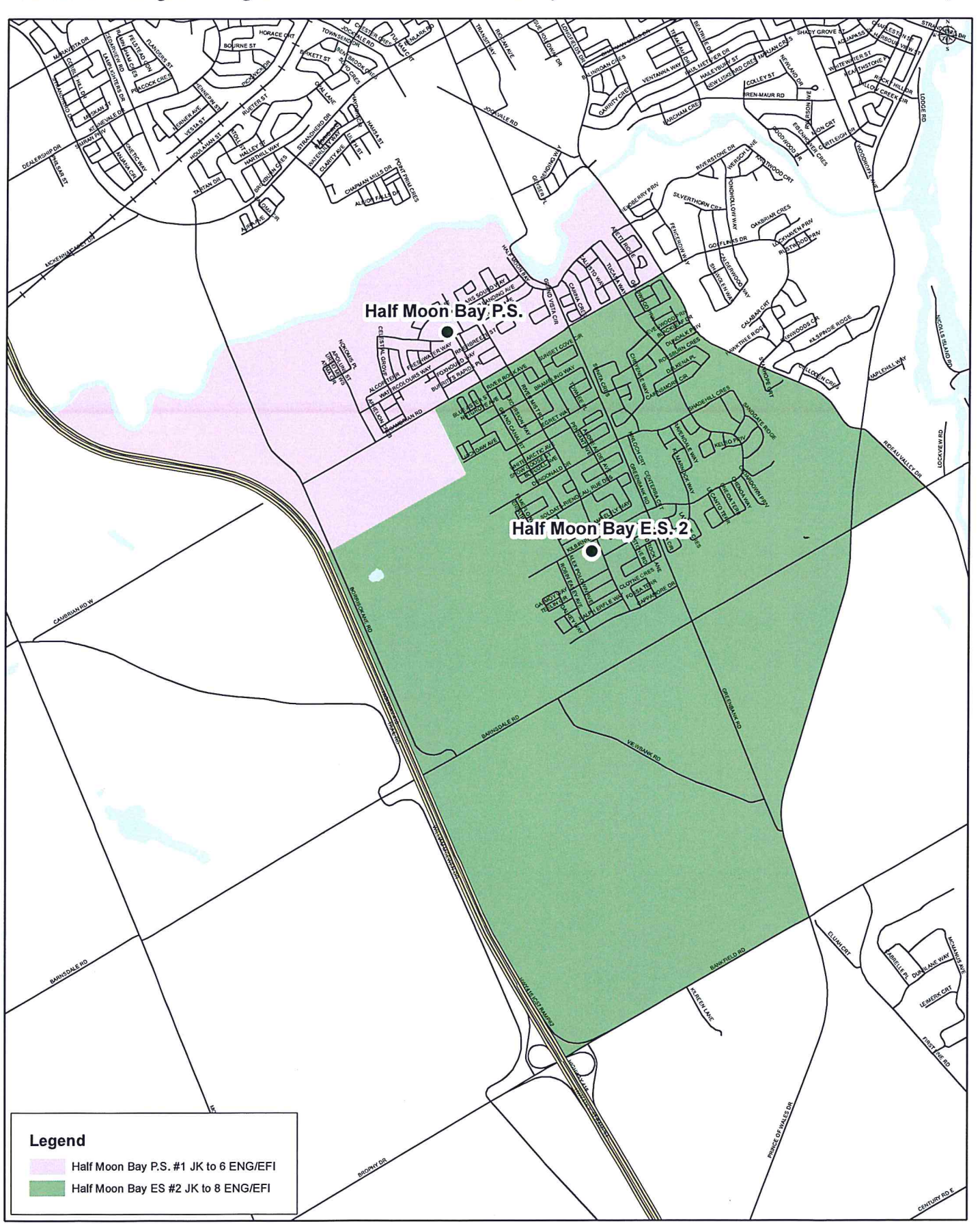
Option A1 - Revised Junior Kindergarten to Grade 8 English Program with Core French and Early French Immersion Attendance Boundary