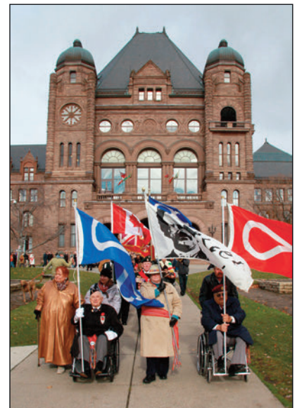
MNO Senators and Veterans lead the procession at a Riel Day ceremony on November 16th at Queen's Park in Toronto.