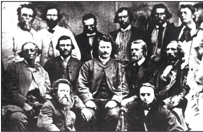
Louis Riel and the Provisional Council in 1869.

Louis Riel was a French, Catholic Métis who was born in St. Boniface, Red River Settlement in 1844. When he was a boy, Riel was sent to Montreal to be educated, and later became an apprentice to a Quebec based lawyer. He returned to Red River in 1868 to assist his mother and siblings after the death of his father. On his trip home Louis heard stories of the conditions and the unrest beginning to grow in the settlements on the banks of the Red River. He started to understand the plight of the Métis and their fear of losing their way of life and ancestral lands.